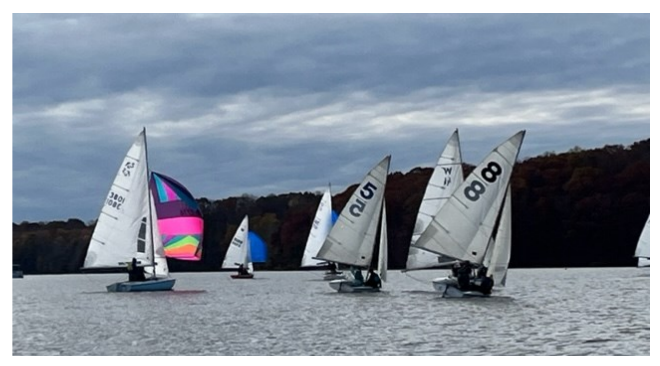
LTYC High School Sailing Team (sail #5 and sail #8) competing in our Fall Series opener—Turkey Day races