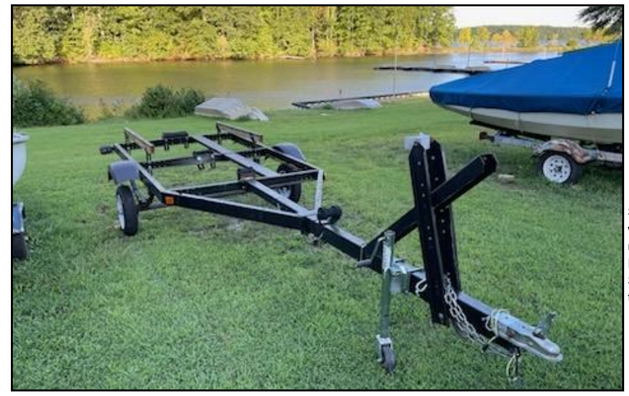
Started with a used Flying Scot trailer