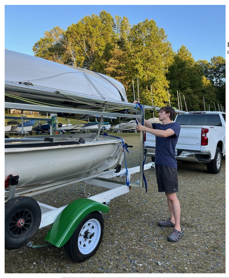
Prepping for the trip to Lake Norman to attend the North Points regatta