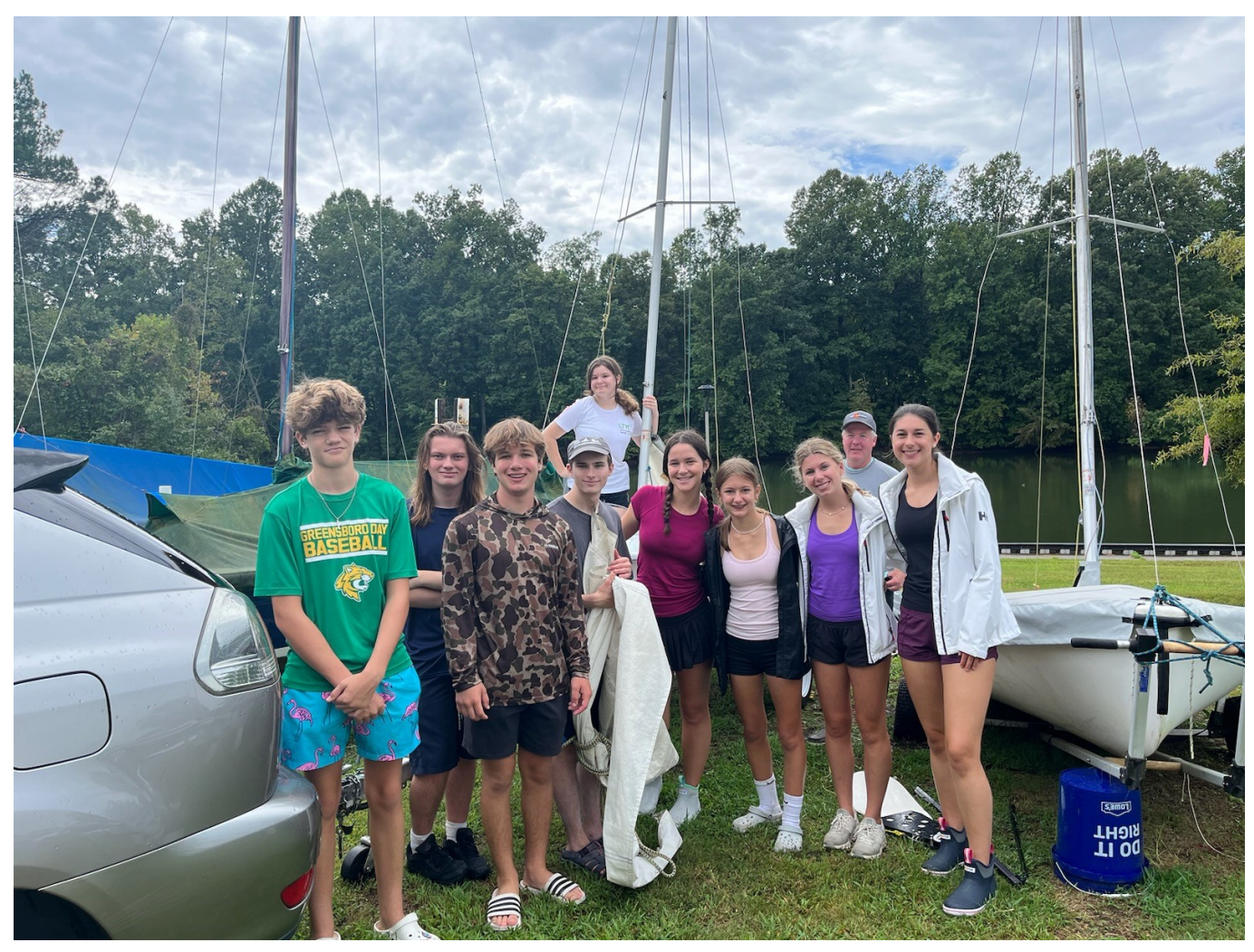
The High School Sailing Team

To get to the regatta, a new trailer was purchased and the team came together to repaint the trailer to LTYC colors and build a rack for two boats and masts. The trailer towed well and looks good at the same time. We are not ready for the 3 more North Points regattas we are planning on attending this season, so the timing of the purchase and build came together well. Thanks to everyone for the help and congrats to the team for the first North Points regatta!