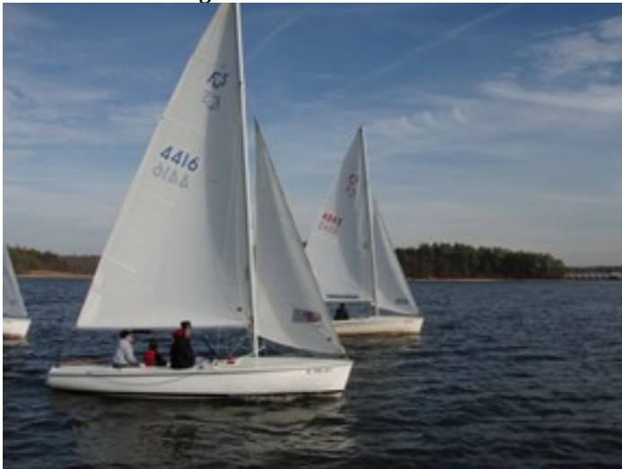
One second after the gun