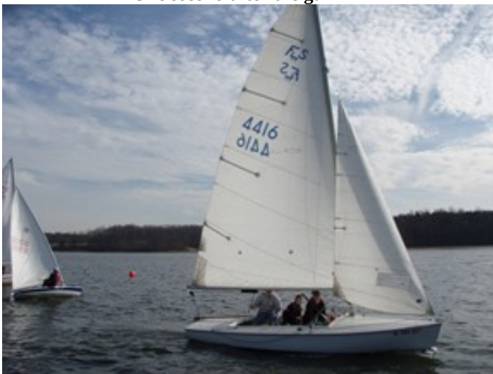
And then to Port