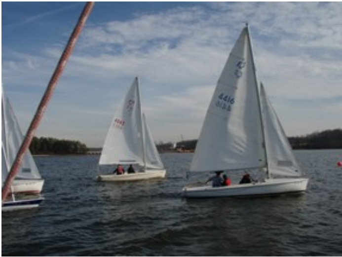
Luffing 10 seconds before Start