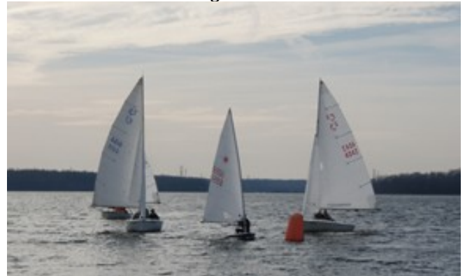
All together Now